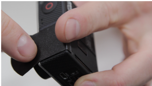
Step 2: Place the lens hood on top of your GoPro and align it with the left edge.