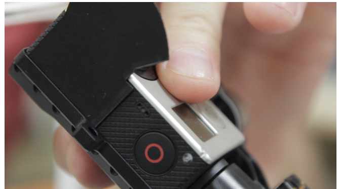
Step 3: Snap the GoPro into the Zenmuse tray.