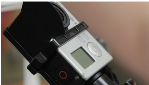
Step 4: Place the retaining bar over the GoPro and lens hood. Install screws.